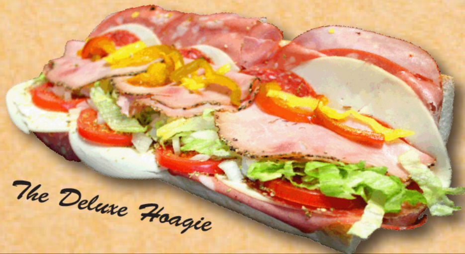
The Deluxe Hoagie