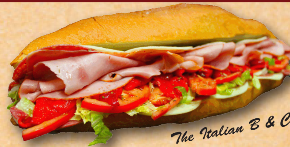
The Italian B & C