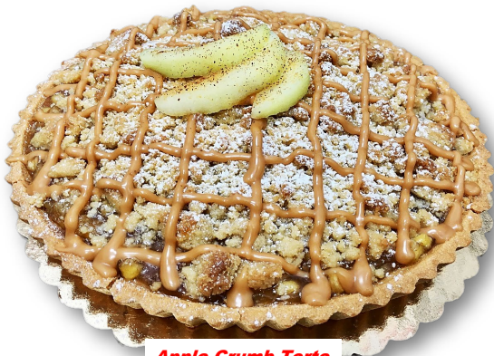
Apple Crumb Torte

Order your Thanksgiving pies & apple torte in store or over the phone!