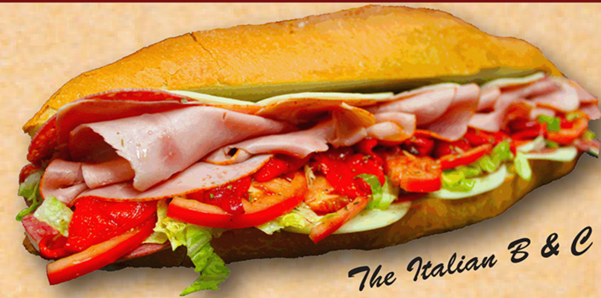
The Italian B & C