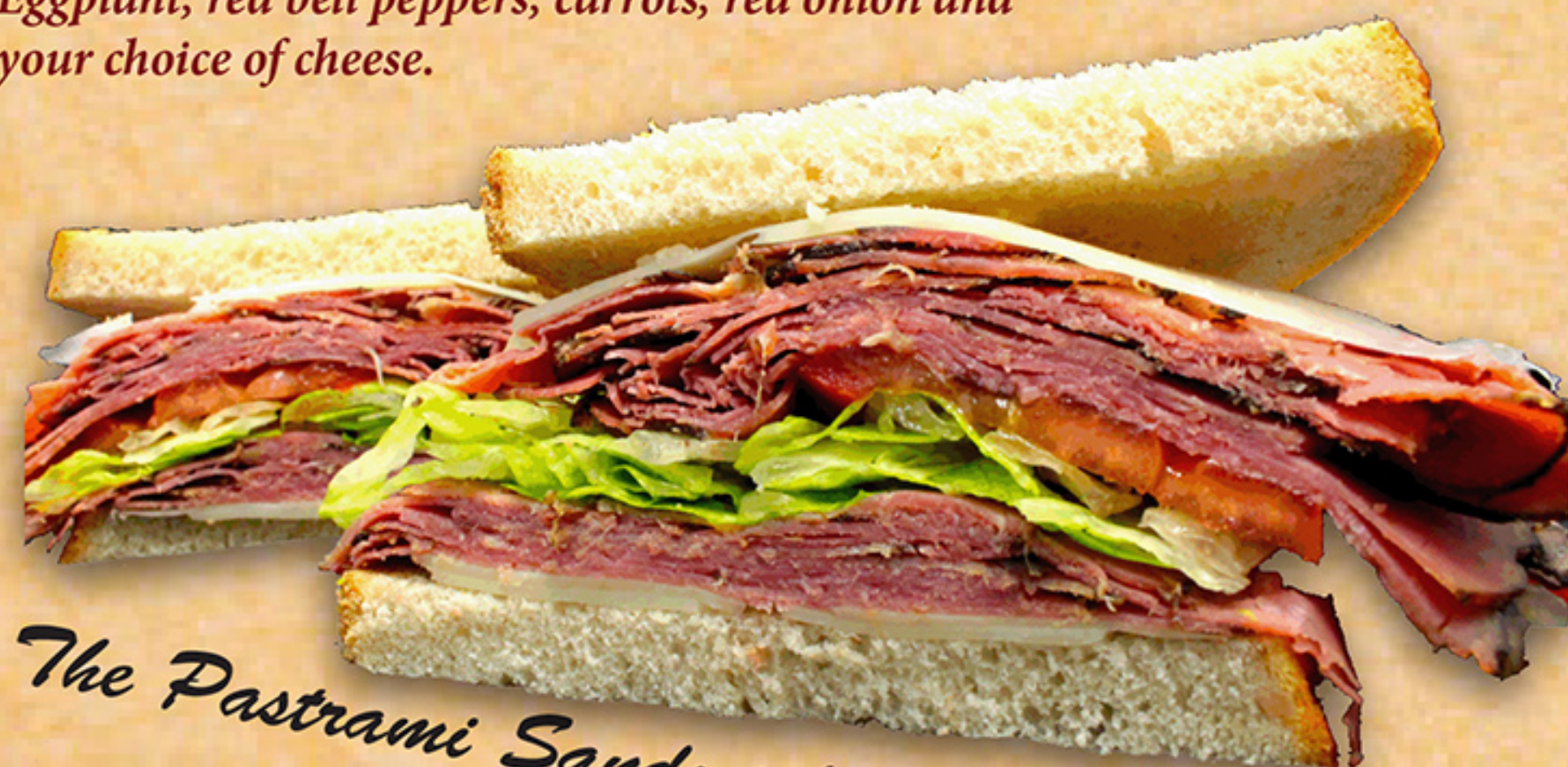
The Pastrami Sandwich