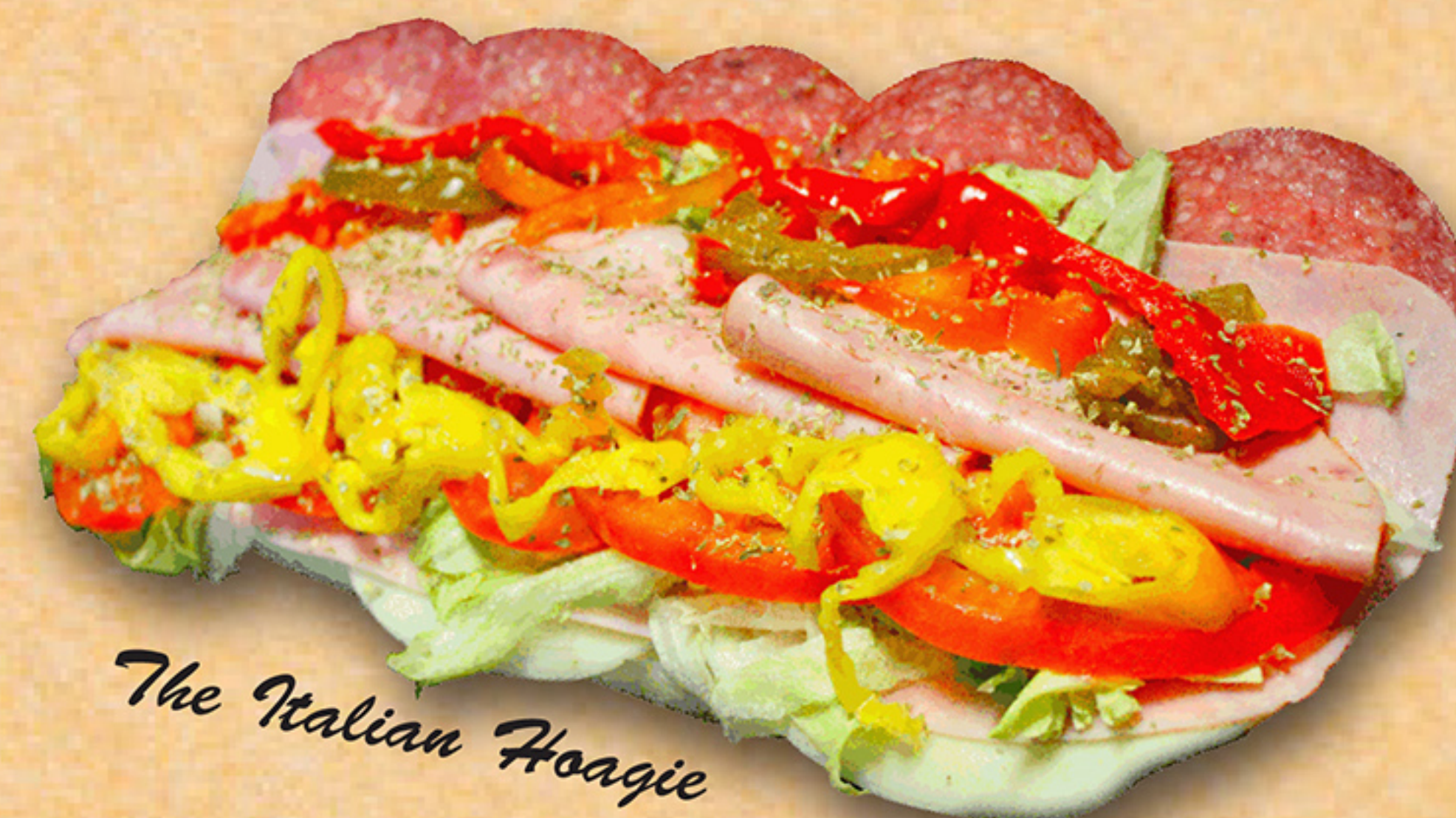
The Italian Hoagie

Handcrafted with authentic Italian meats on rolls baked daily on premises for over 25 years!