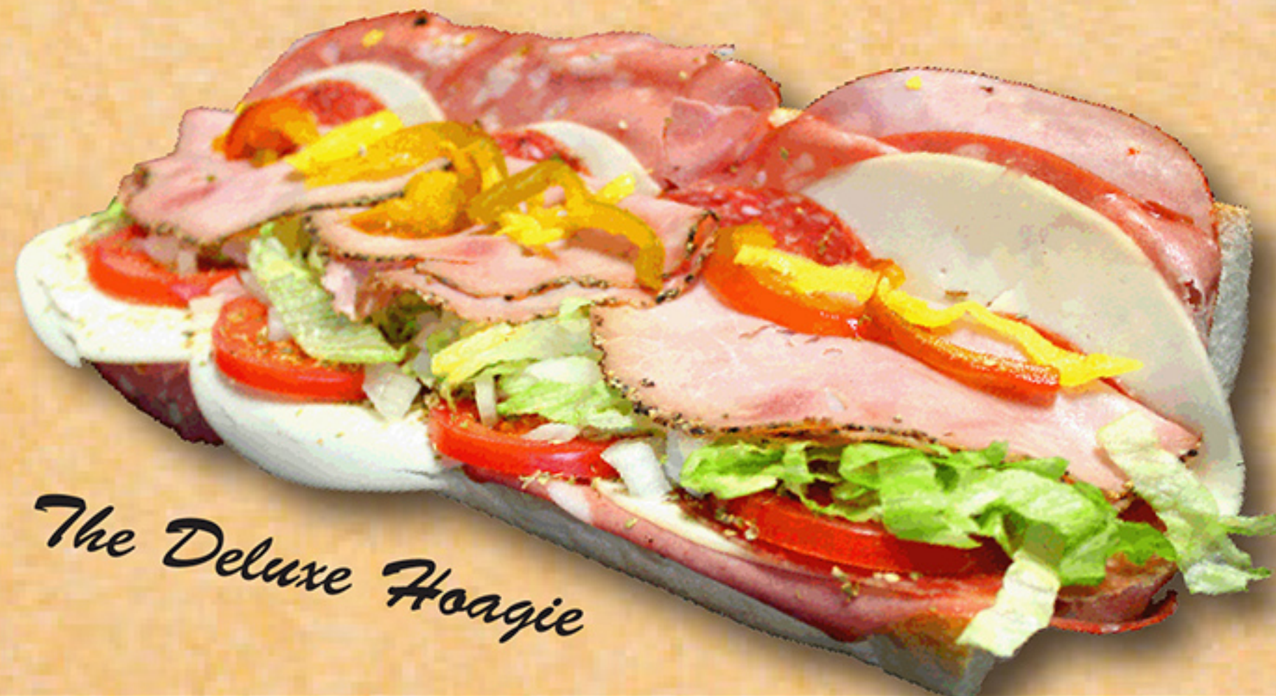
The Deluxe Hoagie